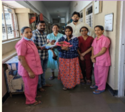
Baby with respiratory distress