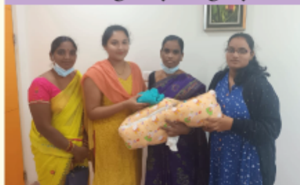
Baby who needed emergency surgery