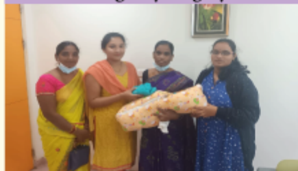
Baby who needed emergency surgery