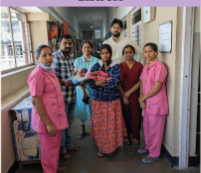
Baby with respiratory distress