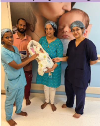
Baby on poor feeding