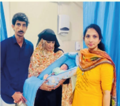
Baby with respiratory problems