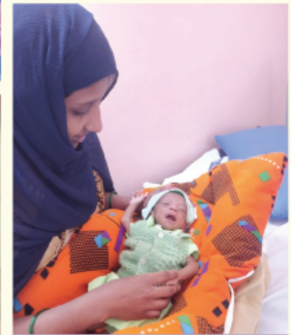
Baby who did not cry after birth