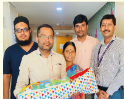
Baby on ventilator for long duration