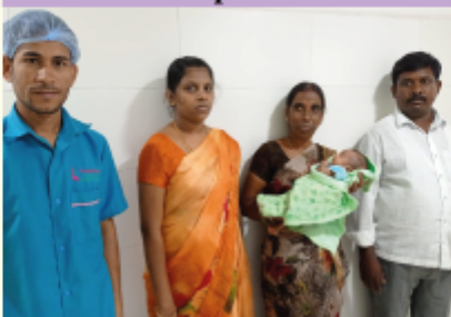
Baby with multiple health problems