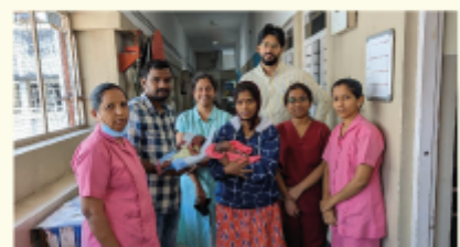
Baby with respiratory distress