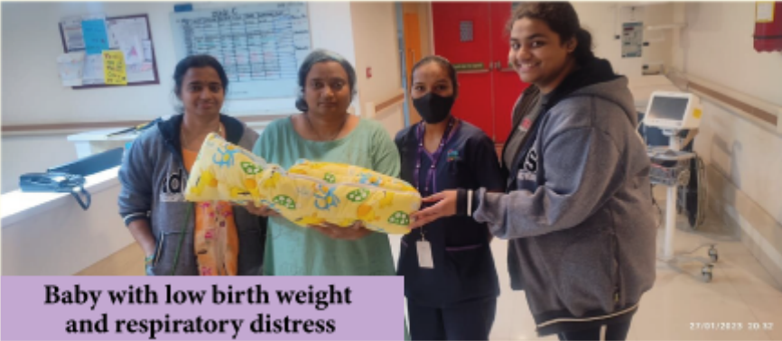
Baby with low birth weight and respiratory distress