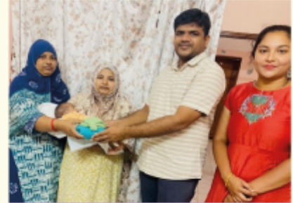
Baby with severe lung problems