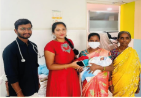
Baby who needed prolong hospital care