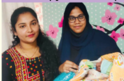
Extremely premature baby